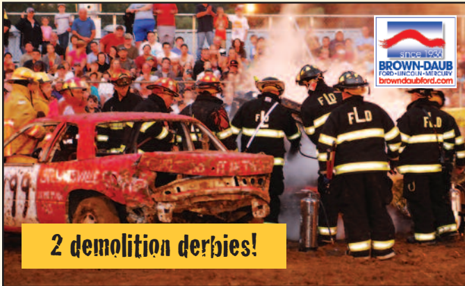
2 demolition derbies!

For more information on the 4-Wheel Drive Truck Pull and the Mud Bog, contact sponsor OK Auto 4WD & Tire at 908-454-6973. For more information on the Demolition Derby, ATV Mud Bog & Tractor Pulls, call the Fair office at 908-859-6563.